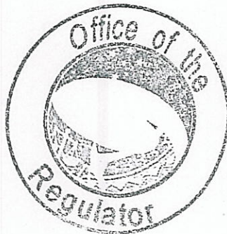
Unutoa Auelua-Fonoti REGULATOR

This Order is effective from the 31 st March 2017.