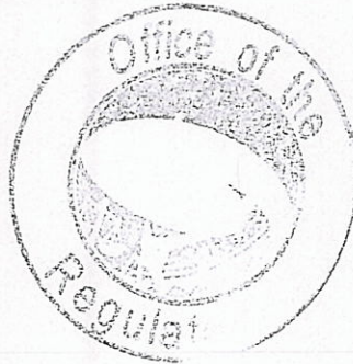
Lefaoali'i Unutoa Auelua-Fonoti REGULATOR

Effective Date of the Order 14 November 2017.