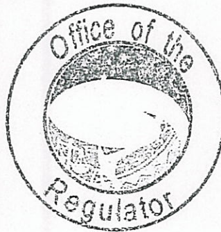
Lefaoali'i Unutoa Auelua-Fonoti REGULATOR

Effective Date of the Order 7 September 2017.