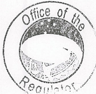
_____ Lefaoali'i Unutoa Auelua-Fonoti REGULATOR

Effective Date of the Order 8 September 2017.